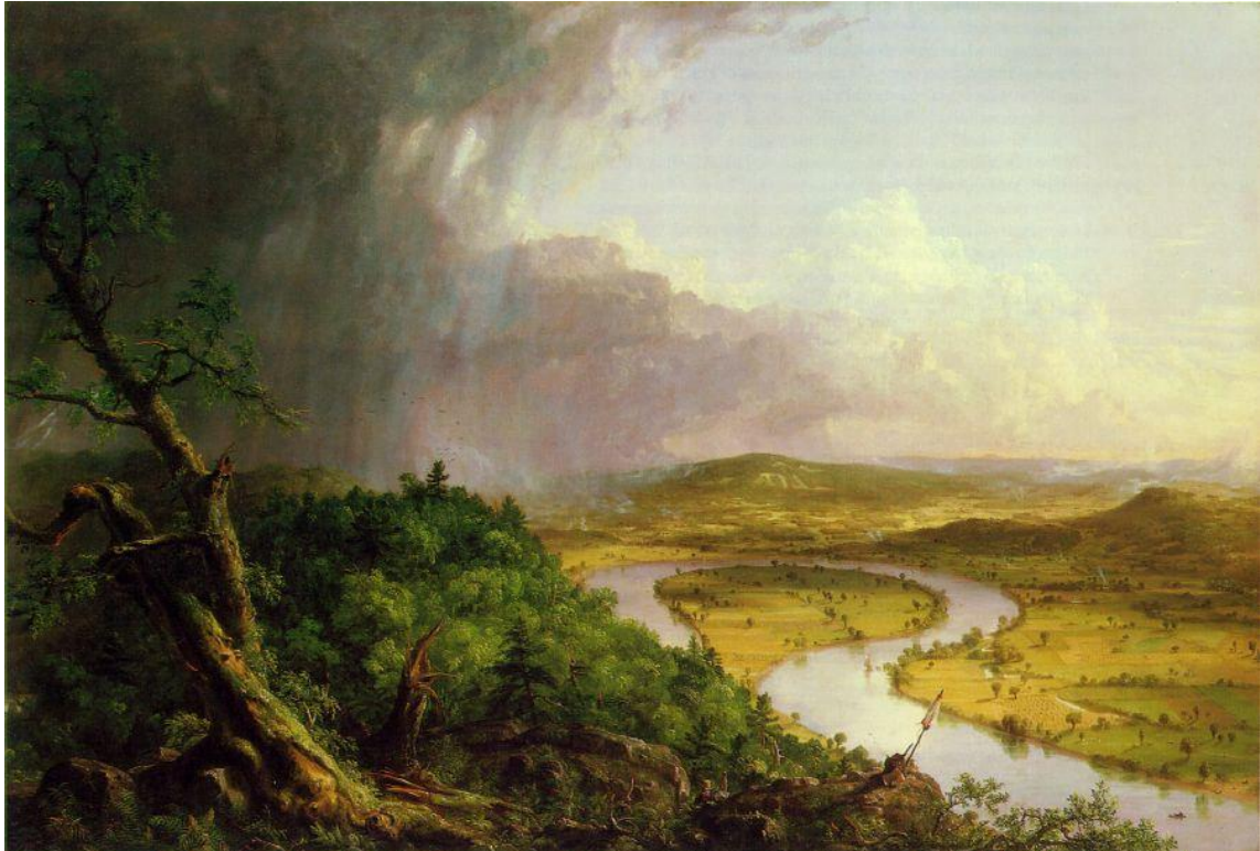
"The Oxbow," Thomas Cole's view of the Oxbow, Northampton, Mass, from Mt. Holyoke. 1836 oil on canvas, Metropolitan Museum of Art

A conference to consider the aesthetic dimension of Edwards' thought